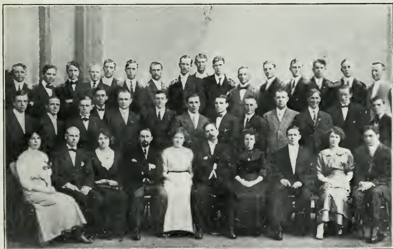
FORMER STUDENTS OF THE BRIGHAM YOUNG UNIVERSITY, PROVO, Missionaries in the Swiss and German, and Netherlands-Belgium Missions. Taken at Rotterdam, July 7, 1912.